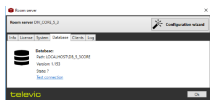
Figure 1-2 Where to find the SQL database name in the CoCon Room Server

You can find the name of the SQL database used in the CoCon server screen.