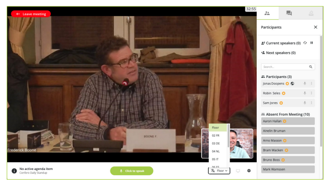
Confero MEET - Language selection in the interface